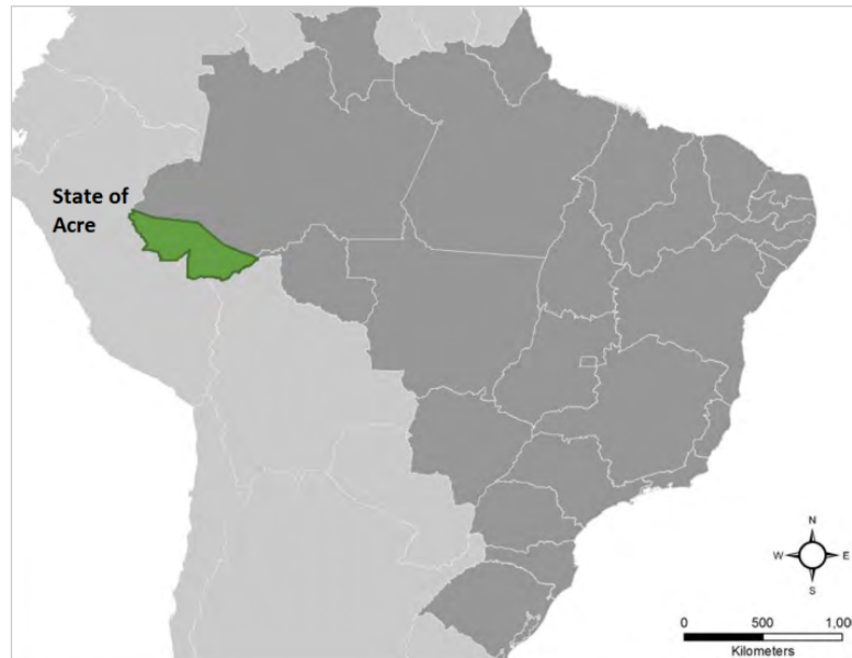
Figure 1. Map of Acre State, in Southwestern Brazilian Amazon

In recent years, Acre has developed several innovative processes in natural resource management and rural governance, including land use zoning, non-timber forest product incentives, sustainable logging certification and rural land dispute resolution, and tenure reform. Acre also took a major step forward by passing an extensive legal framework for providing incentives for environmental services, including carbon sequestration incentives. Additionally, the state of Acre has devised a novel institutional framework to separate regulatory, law enforcement, and carbon investment responsibilities across the jurisdiction, and to incorporate strong social and environmental safeguards.