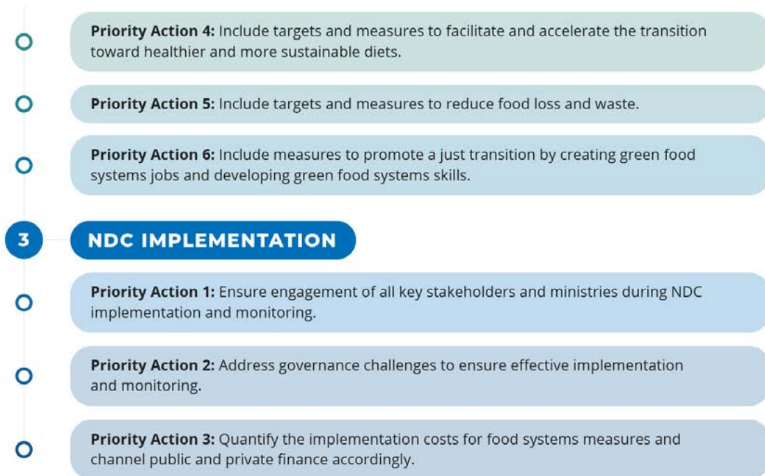
FIGURE 1: PRIORITY ACTIONS, CONTINUED